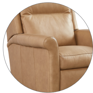
S=Sock #-1FN Standard Base Only