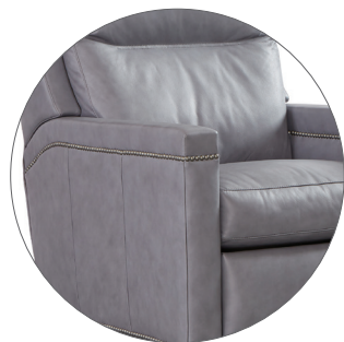
C=Cap Arm #-1FN Standard Base And Arm Cap