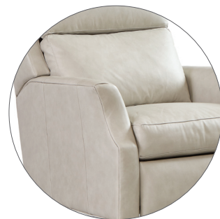
F=Flare Arm #-1FN Standard Base Only