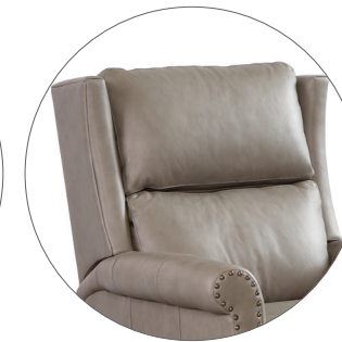
B=Traditional Wing Bustle Back