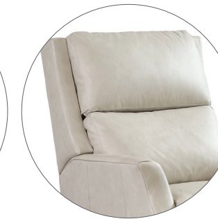
D=Contemporary Wing Bustle Back