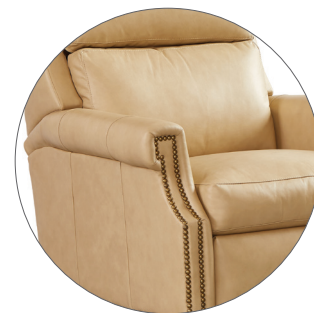
L=Lawson #-1FN Standard Base And Arm Panel