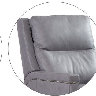
C=Contemporary Wing Single Back