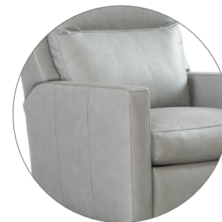
T=Track #-1FN Standard Base Only