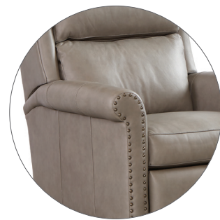
R=Rolled Arm #-1FN Nails Spaced Base And Arm Panels