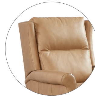
A=Traditional Wing Single Back